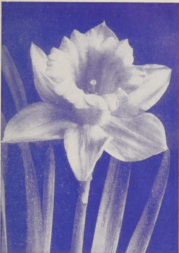
KING ALFRED Giant Trumpet Daffodil

Daffodils give a marvelous display early in the Spring and are lovely for beds, borders, and naturalizing. Stems are strong, stiff, 12 in. or more high. Ideal for pot culture for indoor blooming.